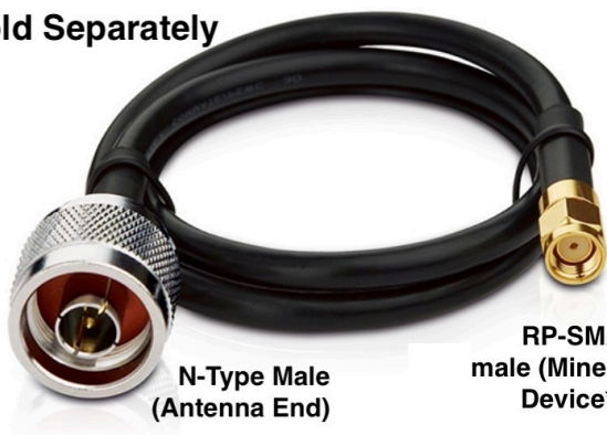
N-Type Male (Antenna End)