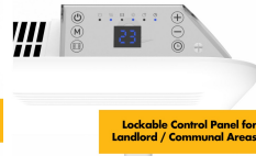
Lockable Control Panel for Landlord / Communal Areas