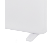
INCLUDES MOUNTING FEET