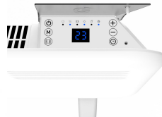
24/7 Program Controller LOT20 / ERP Compliant